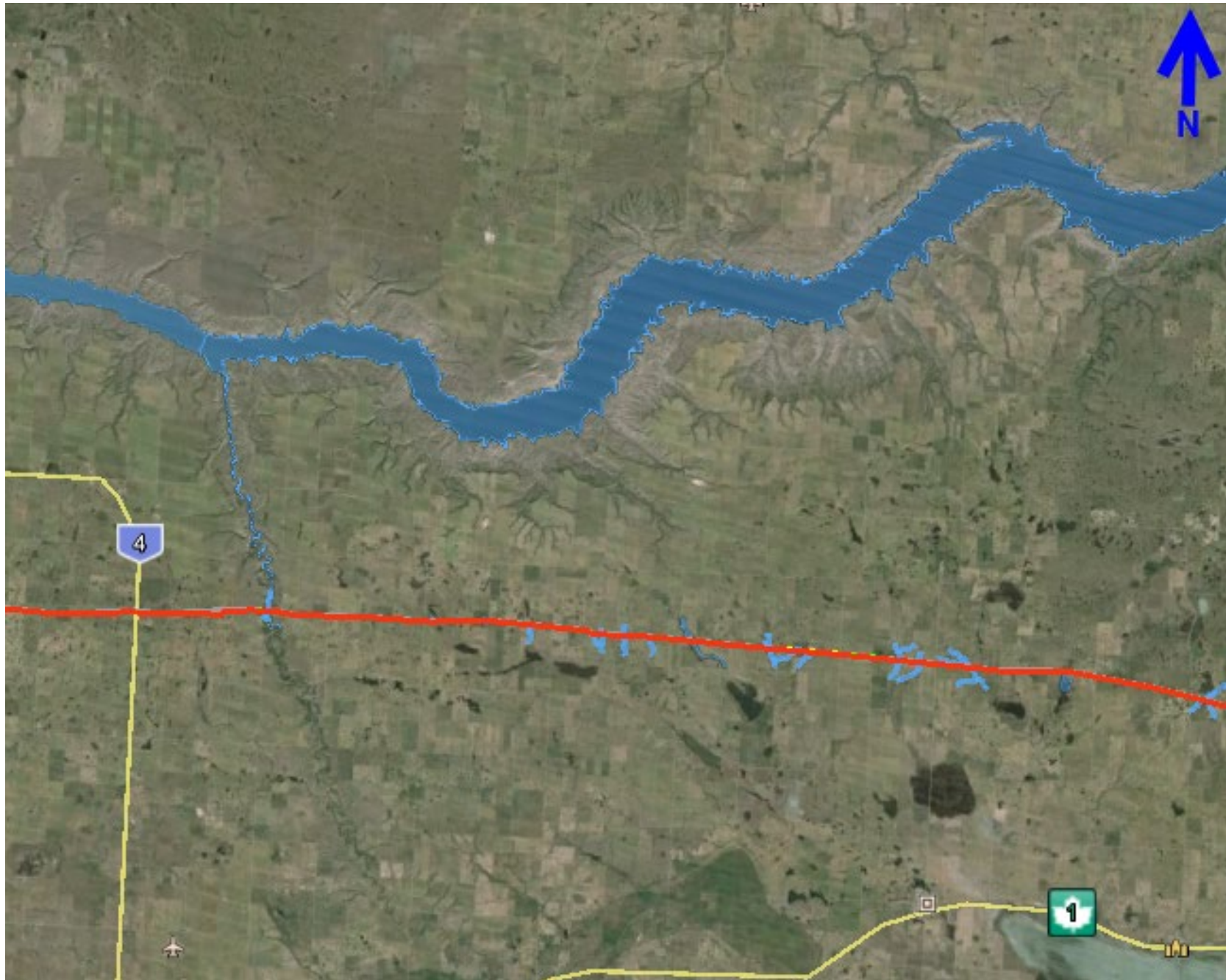
Map 4: displaying the water channels within the GRP