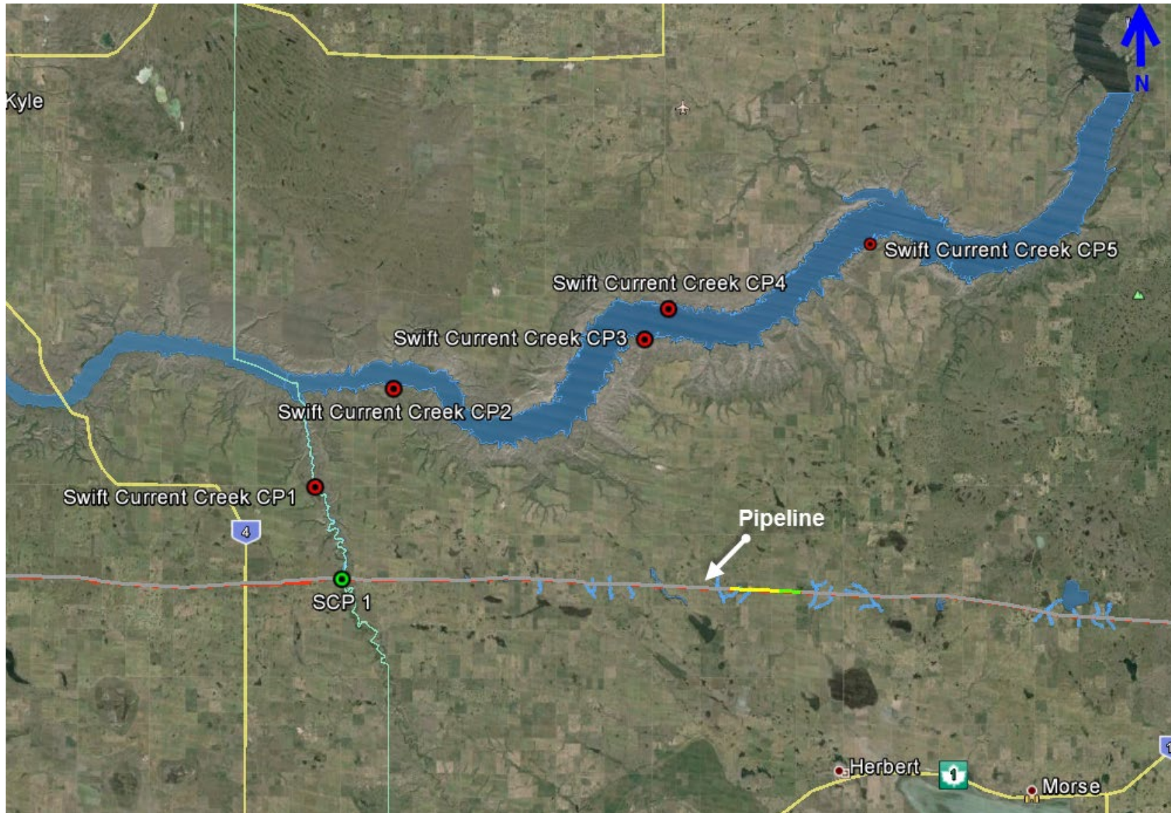
Map 1: Overview Map of entire GRP Area on the Swift Current Creek and South Saskatchewan River