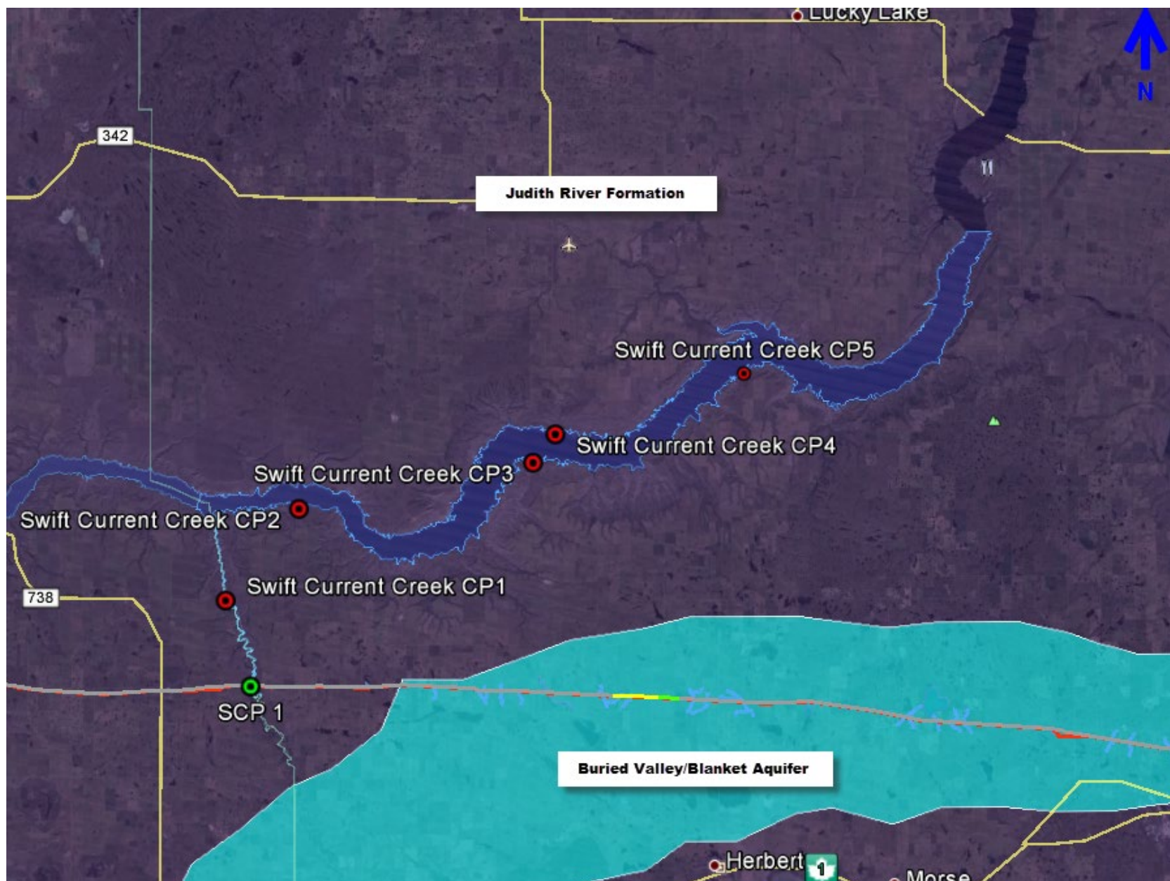
Map 3: displays the two key aquifers with the GRP