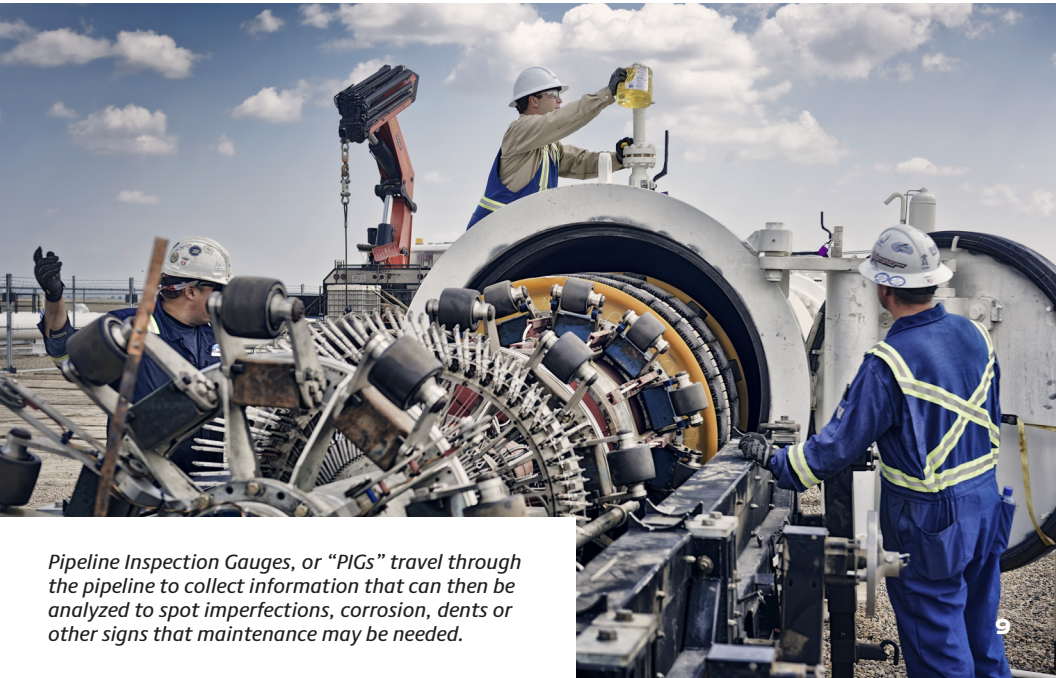
Pipeline Inspection Gauges, or “PIGs” travel through the pipeline to collect information that can then be analyzed to spot imperfections, corrosion, dents or other signs that maintenance may be needed.

In accordance with federal regulations, some segments along TC Energy's pipelines have been designated as High Consequence Areas (HCAs) where extra precautions are taken, known as Integrity Management Programs (IMPs). For information regarding these measures, contact TC Energy at public_awareness@tcenergy.com .