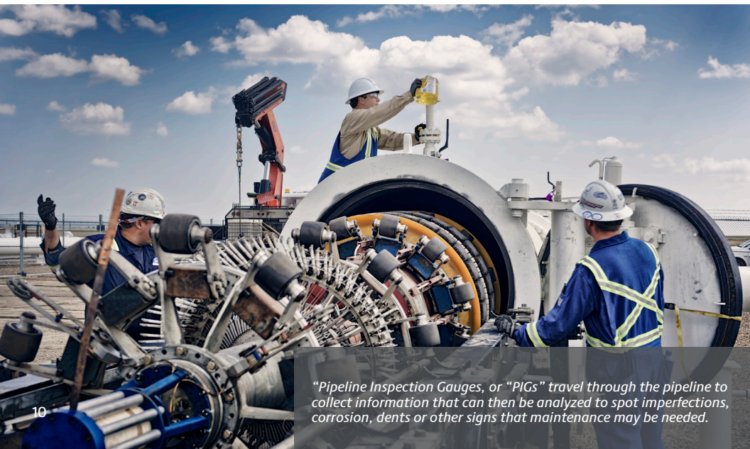
"Pipeline Inspection Gauges, or "PIGs" travel through the pipeline to collect information that can then be analyzed to spot imperfections, corrosion, dents or other signs that maintenance may be needed.

In accordance with federal regulations, some segments along TC Energy's pipelines have been designated as High Consequence Areas (HCAs) where extra precautions are taken, known as Integrity Management Programs (IMPS). For information regarding these measures, contact TC Energy at public_awareness@tcenergy.com .