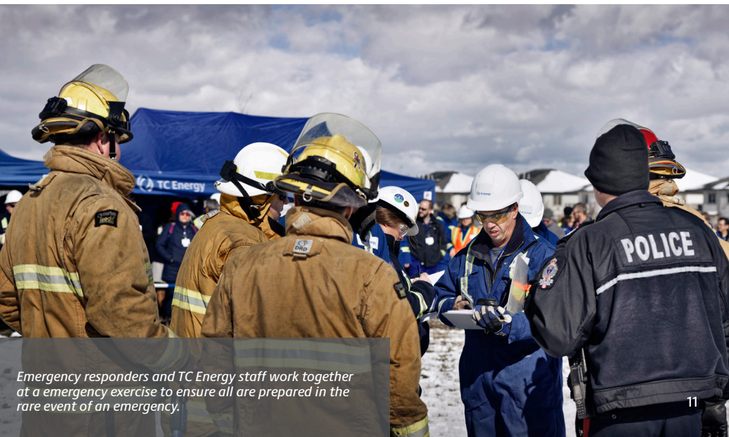
Emergency responders and TC Energy staff work together at an emergency exercise to ensure all are prepared in the rare event of an emergency.

TC Energy's policies and practices for emergency response planning go above and beyond the standard regulatory requirements for emergency response.