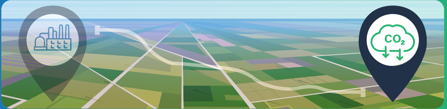
LOW-CARBON HYDROGEN & AMMONIA PRODUCTION FACILITY

a collaboration between Marathon Petroleum Corporation and TC Energy – is a potential low-carbon energy project in Stark County, North Dakota. The project includes a low-carbon hydrogen and ammonia production facility, a carbon dioxide (CO 2 ) pipeline and carbon capture and sequestration (CCS) operations.